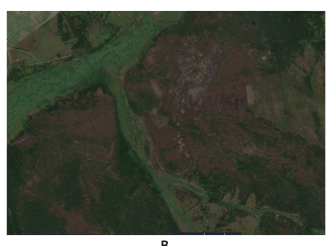
Figure 1 . Consequences (A) and scale (B) of the fire on the territory of the "Drevlyansky" nature reserve, which occurred in April 2020