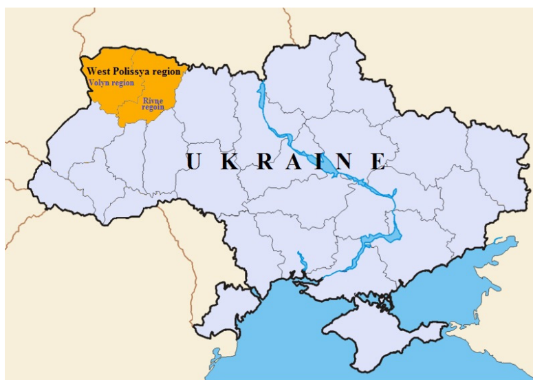
Figure 1. Western Polissya region on the map of Ukraine

In 2019, the share of regional rural residents was 50%. Due to the low level of urbanization, the average population density (54 people per km 2 ) is much lower than the national average, the lowest among all economic regions. There is a significant surplus of labor resources in the region, especially in rural areas. This leads to significant pendulum migrations and departure of residents for seasonal work both within Ukraine and in other countries.